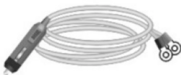
Cigar lighter plug