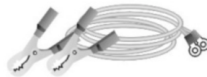
Alligator clip cable

(The above pictures are for reference only, actual product may differ)