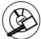
POSITIVE IGNITION OUTPUT

The interface generates 12 V Ignition feed upon engine cranking.