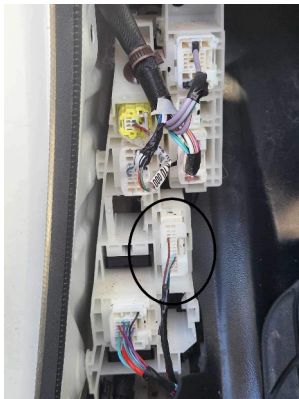
Connector located behind front left (passenger) kick trim. No need to disassemble the vehicles dash.

This kit allows you to add a high quality CMOS NTSC reverse camera system back into the vehicle without cutting into wires or drilling.